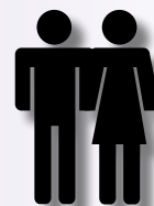
Men &amp; women